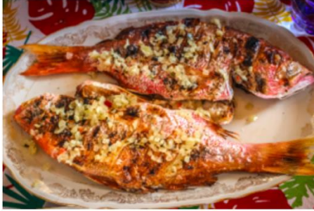
"Untitled"

Today, you will read a short story about a young girl's dinner with her family and several guests. The author, Amy Tan, is an American writer whose work often provides insight into the experiences of Chinese Americans and family relationships.